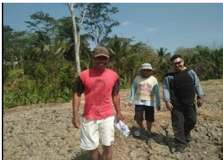
Picture III. Observation of parched rice field

In Java the challenges are different with Sumatra. Back in 2019 the church in central Java was struggling to do their ministry because of lack of fresh water supply. This particular ministry has been struggling to go to neighbor town almost every week to get fresh water as the parched land would not yield any crops. So our director of R&D came and observed in the field that there is stream of river close to the rice field, but the water is depleted during the long drought, and the underground water is at least 50 meters deep. So drilling is a must!