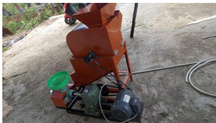
Picture II. Manure Machine

The leadership than agree to send fund for him to build DIY machine. By grace of God, in less than two weeks the machine was ready, and in first trial our partners could produce 100 kg manure. Last January 2021 they produced 7 ton of manure, and most of it has been sold with affordable price to farmers surrounding the church, and as mean to reach out to the UPG who lives and never heard the gospel. They are now can live from the productions and travel to the place they never been before because of the connection they have.