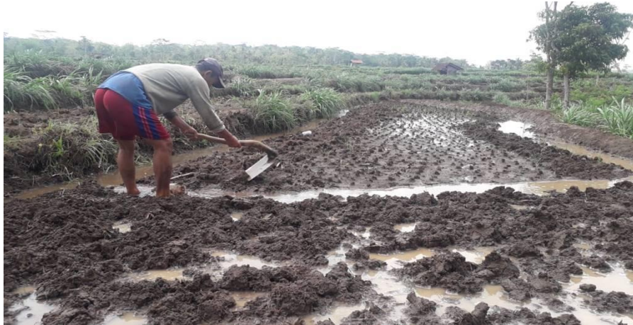
Picture IV. Rice Field with the water